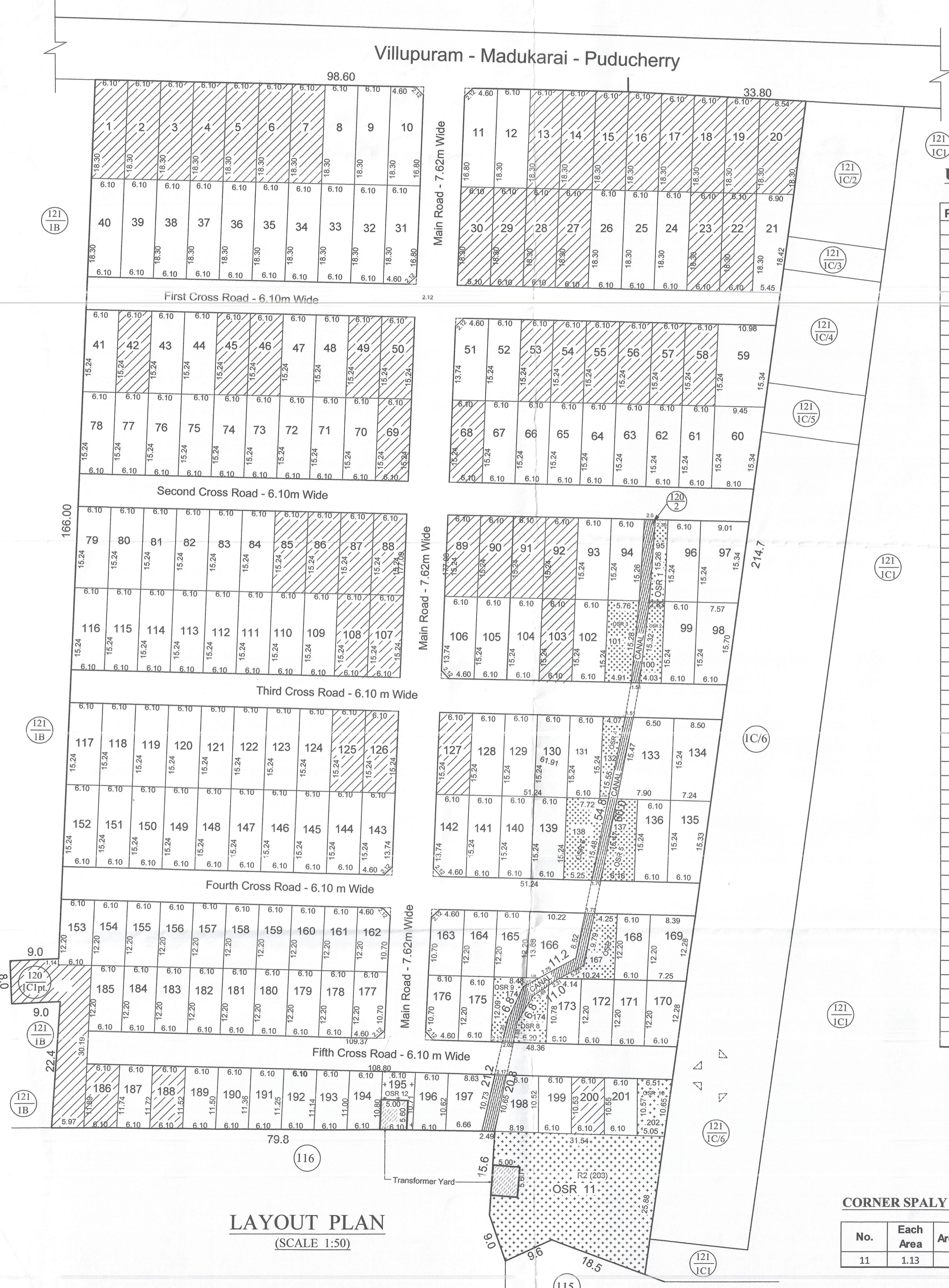
LAYOUT PLAN (SCALE 1:50)

IN-PRINCIPLE LAYOUT FRAME WORK APPROVAL ISSUED VIDE No. PPA/1078/867 DATED 13.11.2022 Z(NCP/Layout/SP-APP)/2018-22 MEMBER SECRETARY PUDUCHERRY PLANNING AUTHORITY *Subject to the fulfilment of conditions Stipulated in the permit (Sl. No.1 to 8 )